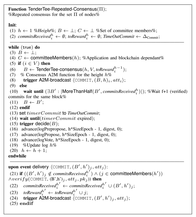
Fig. 3. TenderTee Repeated Consensus algorithm for Obedient node i .

a) Detailed description of the algorithm: We describe in Figure 3 the Tendermint algorithm for the repeated consensus (Definition 2). Each message is sent through A2M-Broadcast (Algorithm 2) and each message received is verified with Algorithm 1 (verify A2M's attestation validity). For a node i, the algorithm proceeds as follows: