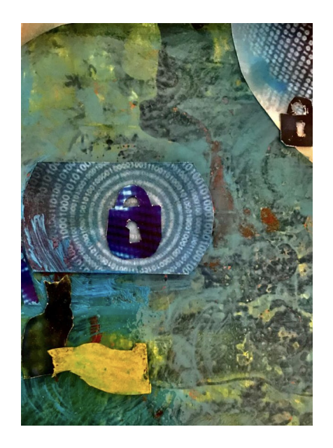
In 2015, NSA and NIST made an announcement for post-quantum cryptosystems. In July 5, 2022, the round 4 finalists were announced [NIS22]. Among them, the following were short-listed: lattice-based, code-based, isogeny-based and hash-based primitives.

Group theory, and in particular non-abelian groups, offers a rich supply of complex and varied problems for cryptography; reciprocally, the study of cryptographic algorithms built from these problems has contributed results to computational group theory.