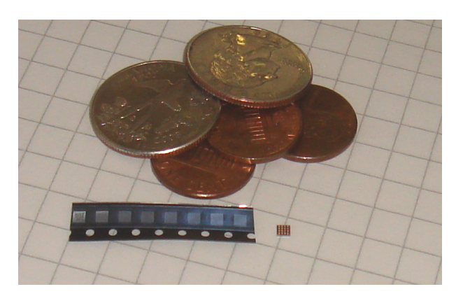
Figure 2. Implementations were compared on the Cortex M0 platform. Pictured is NXP LPC1102, a Cortex M0 self-contained system-on-chip (with an on-chip clock source) that has WLCSP16-packaged external surface area of 2.17 \times 2.32 = 5.03 \text{ mm}^2 or \frac{1}{128\text{th}} of a square inch.

Arbitrary amount of symmetric ciphertext.